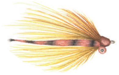
fat dry daffodil