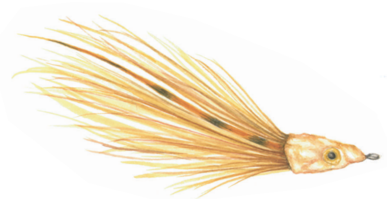
yellow sweeping streamer