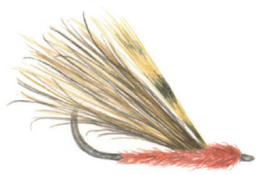
tailing fly brown