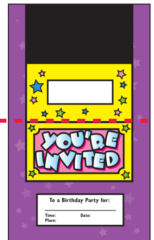
Inside of card