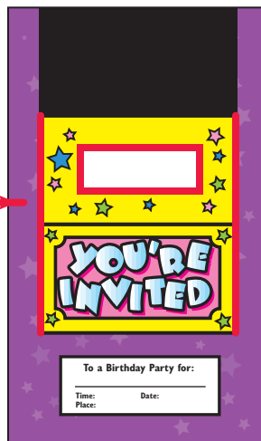
Inside of card